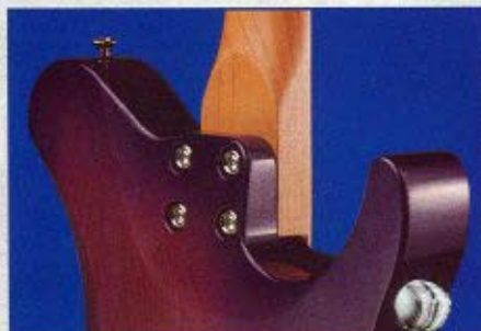
FULL ACCESS HEEL