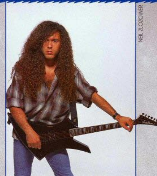
MARTY FRIEDMAN — MEGADETH

The Kelly Standard uses our Low Profile JT-580 double locking tremolo system, combined with our enhanced midrange J-92C pickup in the bridge position, to bring out the aggressive nature of the Kelly's unusual body shape.