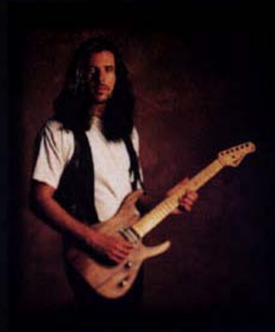
Alex Skolnick