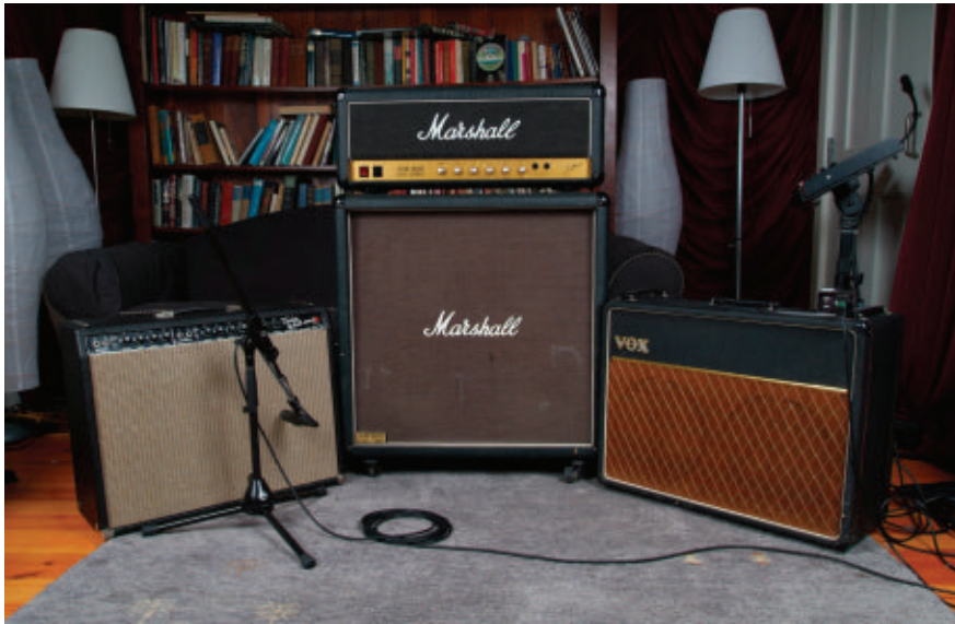
FIG. 2: The real things (from left to right): the 1964 Fender Twin Reverb, the 1980 Marshall JCM 800 with 4 × 12 cabinet, and the 1963 Vox AC30 Top Boost.

better performance on a particular pass would influence the panelists as to what sounded best.