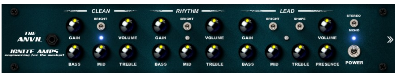
Fig. 2 – The Anvil Front Panel